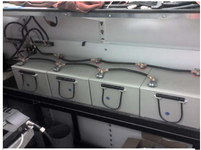
Back-up Batteries as installed at the repeater